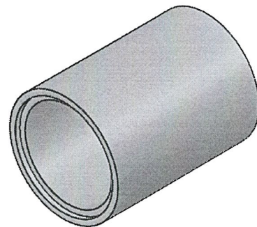
ISOMETRIC VIEW SCALE 1 : 2

** INCOMING PART WILL BE CHECK. IT WILL RETURN IF NOT PASS **