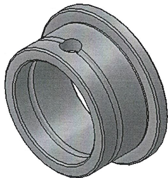
ISOMETRIC VIEW SCALE 1:2