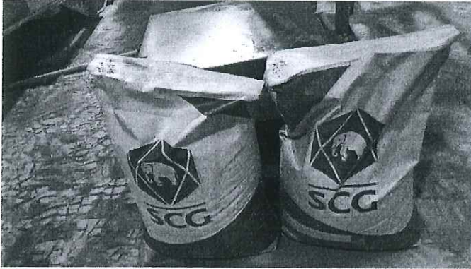
Left Side is 40kg, Right Side is 25kg.